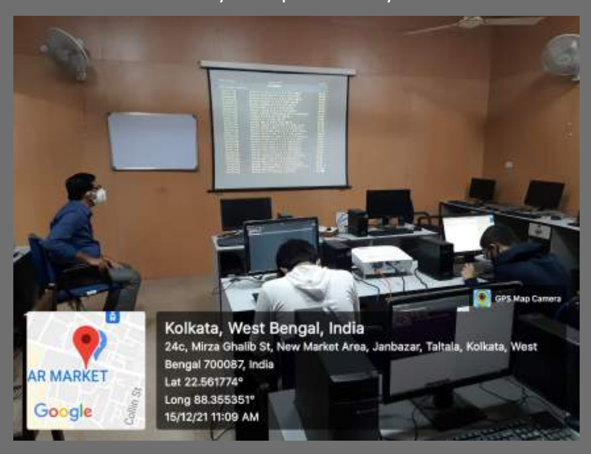
Physics Lecture Hall, G-1